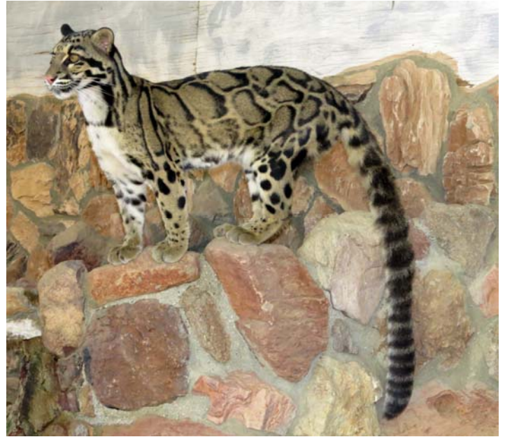
Kyoke is one of two clouded leopards who call EFBC-FCC home. Ted, one of our “senior” cats, also resides at the facility.

The clouded leopards of Sumatra and Borneo were diagnosed within the last decade as a separate species, Neofelis diardi , known as the Sundaland clouded leopard.