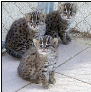
These three Fishing cats were born Sept. 21.

Otis, the fishing cat ( Prionailurus viverrinus ) born to April and Chimlin on July 24, continues to be hand-reared by staff and now enjoys his own enclosure off from public display.