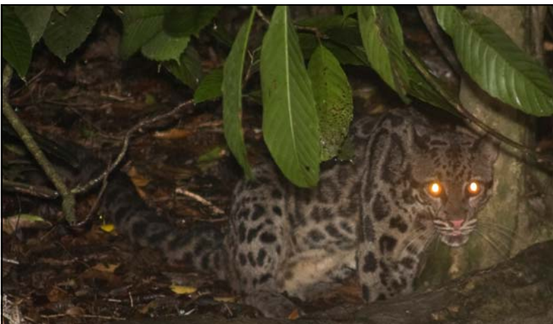
This rare photo of a clouded leopard in Borneo, was taken during a nighttime river cruise.

Is she a big cat or a small cat? Well, for the clouded leopard they’re in a class all their own – Neofelis – as opposed to the big cat genus of Panthera . However, they are known as the smallest of the “big” cats. Weighing in at only 30-50 pounds full grown, these cats are found in a wide range of forests in tropical Asia, including Bangladesh; Bhutan; Cambodia; China; India; Lao People's Democratic Republic; Malaysia (Peninsular Malaysia); Myanmar; Nepal; Thailand; and Vietnam. They are listed as “Vulnerable” in the wild by the International Union for Conservation of Nature (IUCN) and their populations are considered to be in decline.