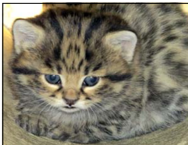
Black-footed cat born Oct. 5.

On Sept. 21, our "super couple" of Fishing cats , Kai and Nemo, became parents again. This time to three adorable kittens. Kai is a pro at raising a rowdy group of babies, and they are all doing well!