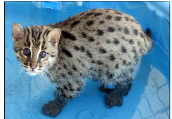
Otis the Fishing cat was born July 24.

The Sand cats ( Felis margarita ) born on May 2 are all doing well and living in enclosures that are not in the public areas, as these cats can be high-strung and sensitive to groups of people. At eight months, they are almost full grown and have been separated by sex. The males, Anubis and Osiris, live in one enclosure, while the females, Safi and Margo, share another.