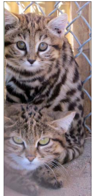
Booker (top) with mom Gabby.

Not to be outdone by Killa and Gabby, our second pair of Black-footed cats , Josephine and Mr. B, also became parents on Oct. 5 to one kitten. As of press time, it has not been named, but it is doing very well and Josephine is a great mom.