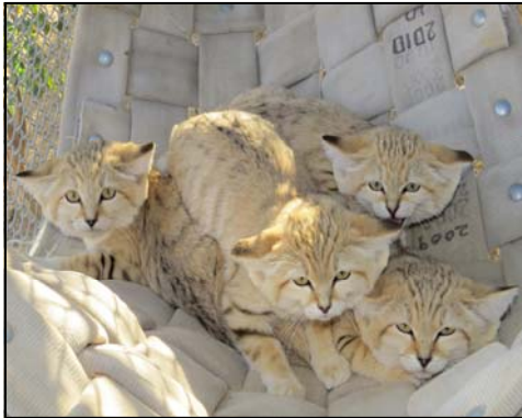
The Sand cats were born May 2.

The Sand cats ( Felis margarita ) born on May 2 are all doing well and living in enclosures that are not in the public areas, as these cats can be high-strung and sensitive to groups of people. At eight months, they are almost full grown and have been separated by sex. The males, Anubis and Osiris, live in one enclosure, while the females, Safi and Margo, share another.