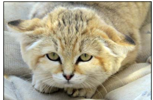
Sand cat born at EFBC-FCC in May 2014.

Snow Leopards: Shipping cost estimate is around $6,000 per cat.