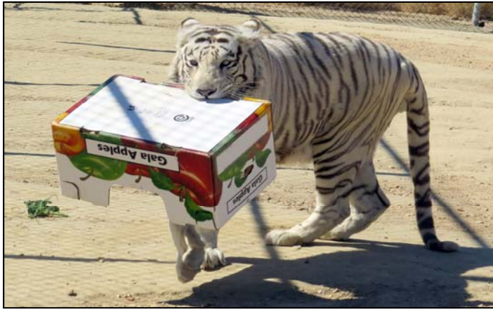
Katmandu, the white tiger, plays with an enrichment created by a young Kids Day attendee.