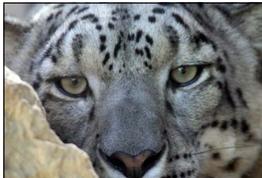
EFBC's male snow leopard Zach.

The following felines are scheduled to arrive within the next three months: