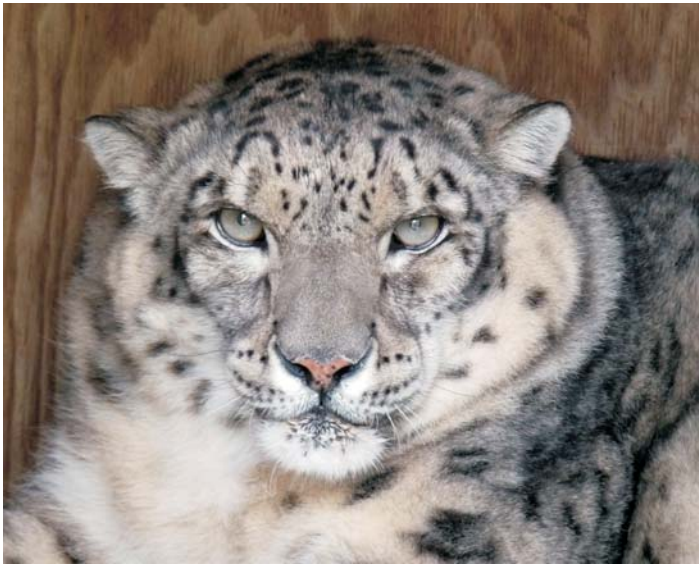
Like all cats, Wild and Woolly are not happy about being moved, but over time they will come to know the staff and they will adjust.

not on exhibit. The male tiger is named Bubba, and the female tiger is named Cleo. Their adoptive costs are $200 per month. Adoption commitments are for a minimum of six months, and if you pay for 11 months at one time, you get the twelfth month free. Neither of these animals will be used for breeding.