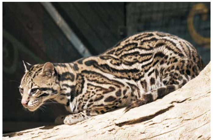
Rico is our educational ocelot, often enjoying the day from a top his log.

She thought it was a bobcat and noticed it was in pretty good condition, adding that the driver put the lifeless cat in her vehicle. I don't think she realized it wasn't a bobcat until she got home.