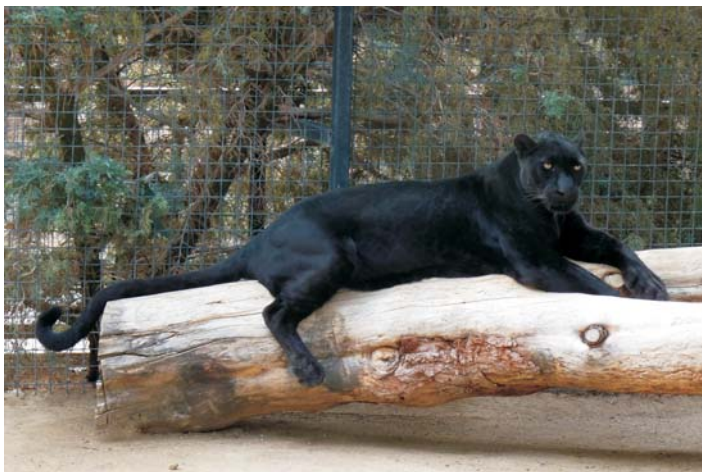
Tran (leopard) relaxes on a cool winter day