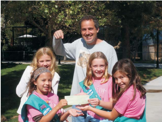
Girl Scout Troup 1187 presenting a check to EFBC/FCC from monies they raised for the cats.