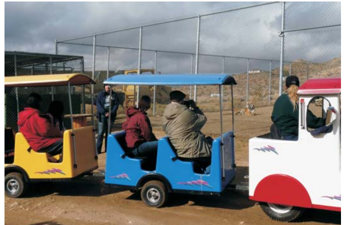
The train ride at Kid's Day was popular as usual, and was only temporarily stopped by the muddy road.