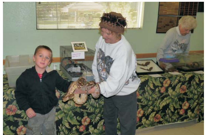
Kid's Day - Individual animal shows were given this year, due to the wet weather outside.