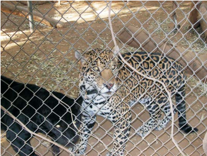
Rocco and mate.

Almost two years old now, Rocco is a very good