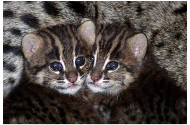
Our newest additions to the fishing cat breeding program, born July 26.