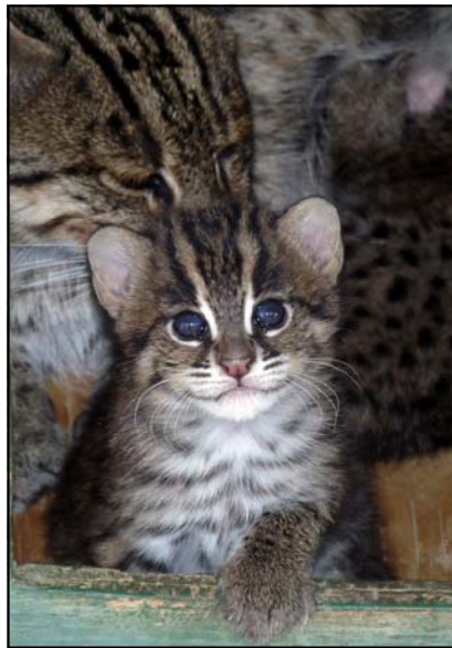
Mama Kai with one of her babies.

Serrano has adjusted well to his new home. After spending time in our quarantine area, Serrano is now on display in one of our large natural habitat cages.