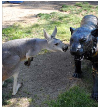
Zoo to You provided fun encounters with several animals, including a marmoset, kangaroo and alligator.