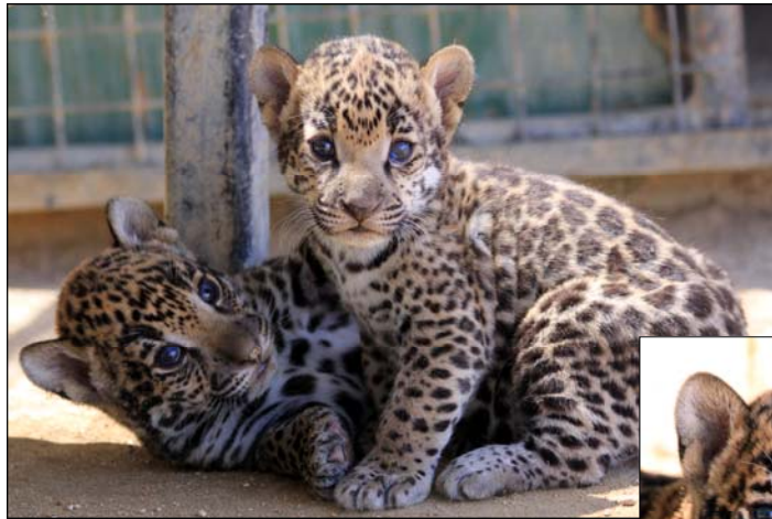
(Above) Nadarr and Myress play. (Right) Nadarr.

Serrano was taken out of the wild after exhibiting behavior that was not normal for a wild young male cougar. He was not aggressive and he was appearing on hiking trails during the day.