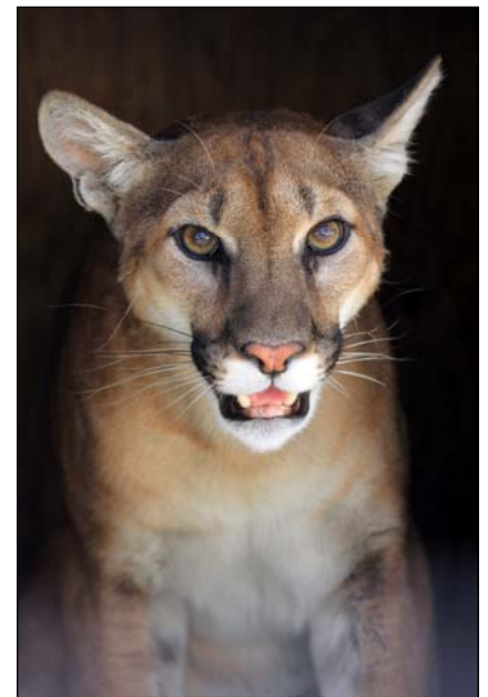
Serrano is now on display in the visitor area.

All of our new felines made their debut at the September Twilight Tour.