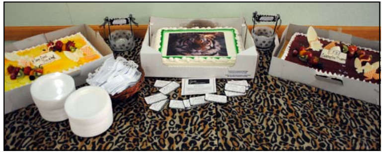
Our 35th anniversary cakes included one featuring Ceasar (center)

The 2013 Fabulous Feline Follies, will take place on Aug. 17. We accept high-end donations for the silent and live auction year-round.