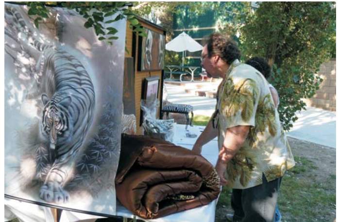
The sale of silent Auction items help fund important projects.