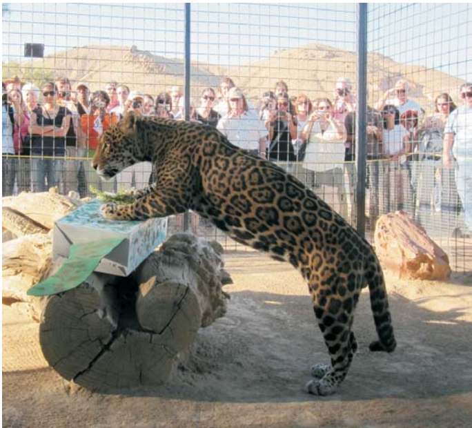
Patrons admire Poncho (jaguar) at play.

We have had a surge in memberships, and we would like to thank both those new members and our continuing members for the support they have shown. It is this community that allows us to exist, and we never forget that. Please keep doing what you have been, spreading the word that we are out here working toward a better world for felines. A special thank you to Westways (AAA) - our Twilight Tour attendance in June broke a new record, and we expect that record to be broken on September 18th, at our final Twilight Tour of the year.