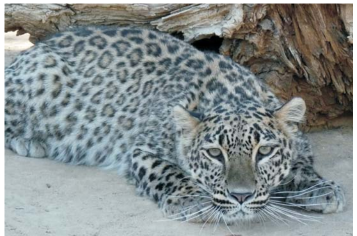
Kiana (Persian leopard) is housed off display, and seems to be stress free and content.

It has been reported that there are less than 1000 Persian leopards now existing in the wild, most in Iran. This is disturbing news since this highly adaptable animal once roamed throughout the caucases region. This is the same region the Caspian tiger once called home. Caspian tigers