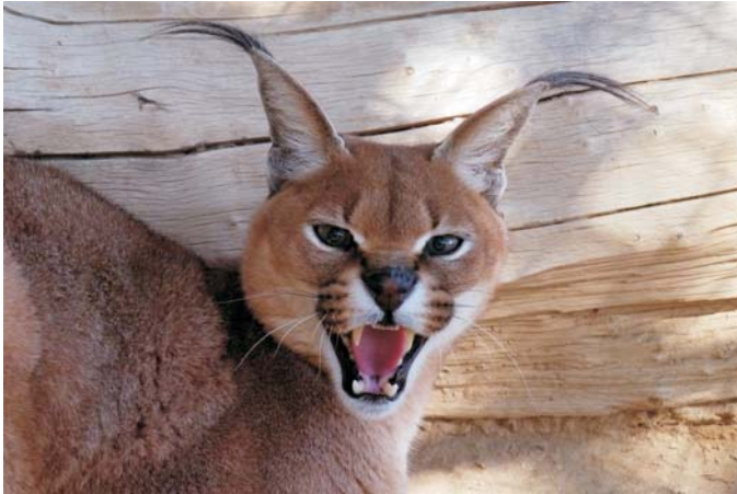
Kalaj, (Caracal) is often a favorite although he is not as active as he once was. He turned 13 on April 8th, 2009

It is believed that less than one hundred mountain lions live in this area of the east coast, although they once were found throughout the country. California is the only state that has a law against hunting them.