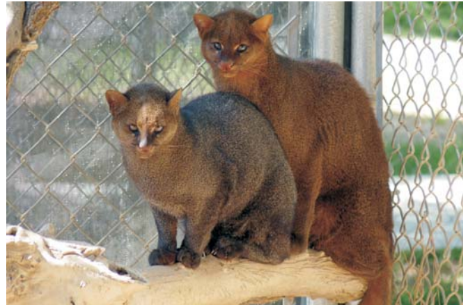
Jaguarundi, Maya and Aztec

rigorous imprisonment and fined US$40. This is the highest fine of any poaching related crime in the country.