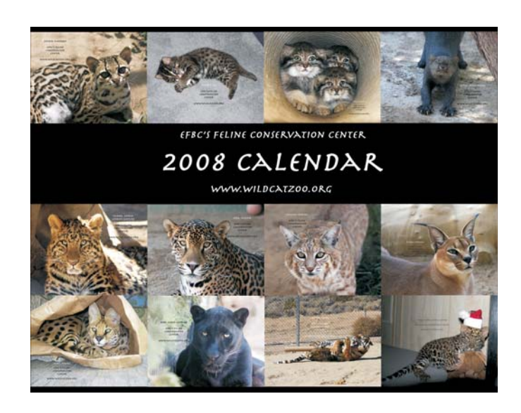
The new 2008 calendar.

For some stores such as Best Buy you can purchase online and then pick it up at a local store. Online shopping is the way to go with gas prices so high, and you get the bonus good feeling