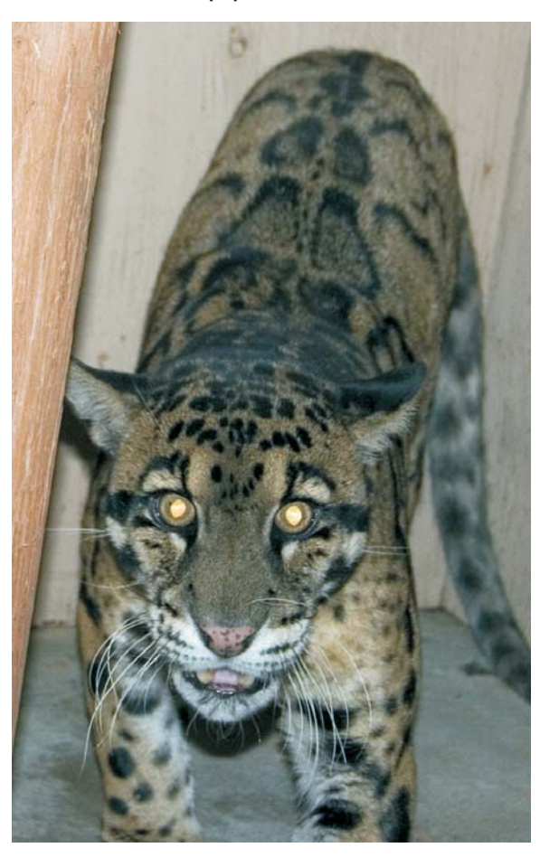
Ted is a good looking cat

Clouded Leopard - On July 17th, 2007 we received Ted, a clouded leopard from Kansas. These leopards are the smallest members of the "big" cat family, topping out at around 50 lbs. We are making him as comfortable as we can, and hope he will be a good educational animal for our display area. This species is suffering in the wild as are all of these top predators.