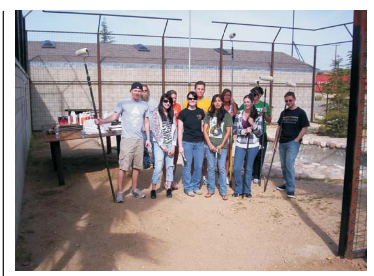
412 OSS/OSAT from Edwards AFB

Fishing cats are now considered endangered. Native to riverbanks from India through Southeast Asia, these cats love to fish. They have partially webbed paws and a double layer of fur so when they go in the water they don't get wet down to the skin. They don't have full claw sheaths (similar to the cheetah) so their claws are partially visible even when retracted. Although they have a substantial range in tropical Asia (over 1 million square kilometers), its actual area of occupancy is much smaller as it is strongly associated with wetlands. In 2003 it was reported that 45% of protected wetlands and 95% of globally significant wetlands in Southeast Asia were threatened. Water pollution and forest clearance for settlement threaten the species through much of its range. Deforestation