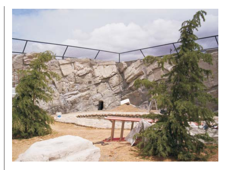
by the June Twilight Tour. Hopefully we can get a start on the other side soon.