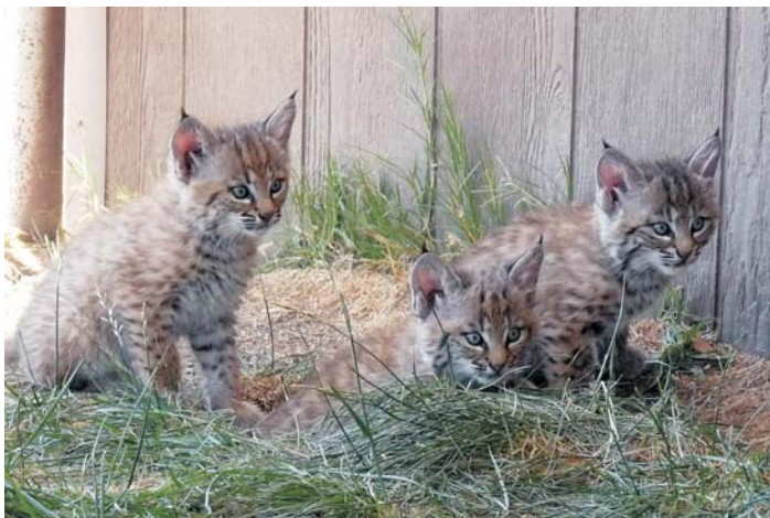
These adorable kittens are being hand raised, off display.

Typical signs of inbreeding include crossed eyes, curvature of the spine, twisted necks, and shortened tendons in the legs. As inbreeding