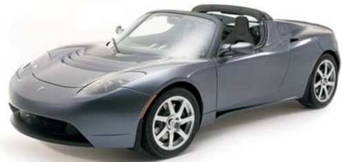
A supporter of the FCC has agreed to auction a ride in his Tesla roadster at this years Follies Event.

This all electric sports car should appeal to those of you that have visited on your way to Willow Springs. How fast is the acceleration? A trick