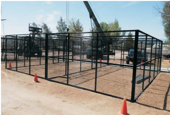
New caging is being constructed quickly where the old "main" enclosures once stood. The cage space is needed!

Working at EFBC/FCC was a life-changing experience for me. I can't imagine what my life would be like without it. When people ask me why I continue to drive 5 hours on a Saturday to work three hours at a Twilight Tour and then drive back home immediately the next morning, I can't really put it into words they'll understand...unless they've visited the EFBC, seen the cats, held a baby