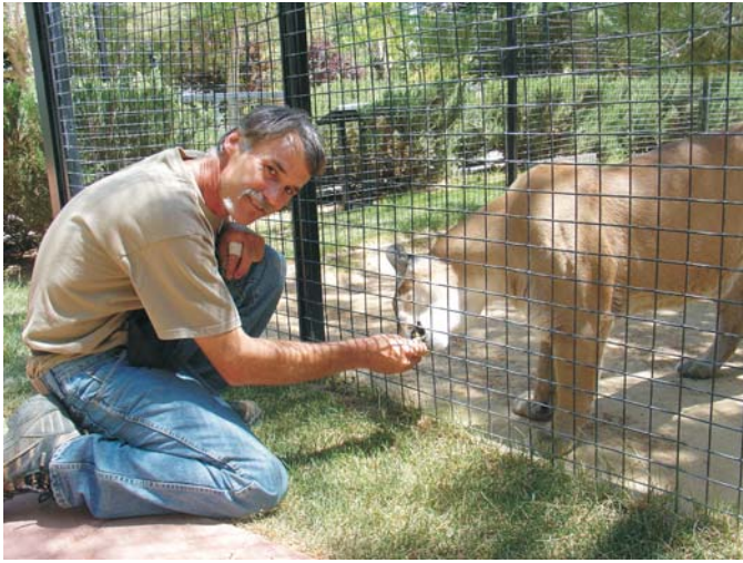
Teddy the Puma is always a favorite of the volunteers and staff.

My journey began in Bolivia where my daily duties included walking an adult Puma along various jungle trails. I developed a close trust-bond with these rescued wildcats, and knew that I had "found my place". I hope to gain an extensive education and intimate knowledge of the urgency needed to save these very special animals from possible extinction. I thank all of you who donate your merchandise and money needed to make all of us proud in sharing this common goal: Humans united in the protection of endangered wildcat species. See you all at the EFBC, and remember LONG LIVE THE CATS!