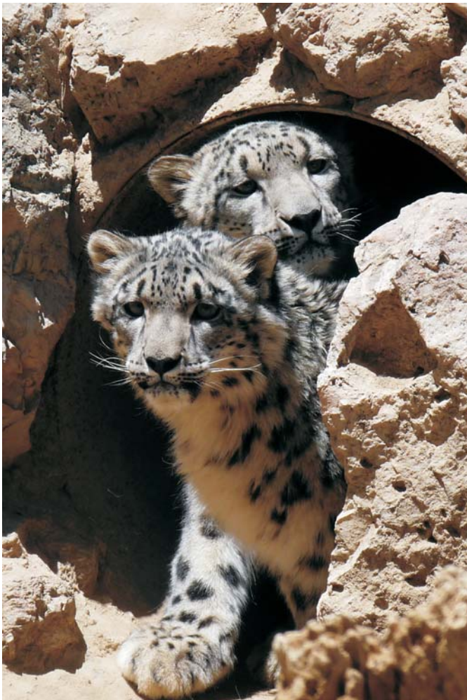
Zach and Annye investigate their new home, one of the large natural enclosures in the educational area.

DEDICATED TO THE PROTECTION AND PRESERVATION OF ENDANGERED FELINES SUMMER 2009