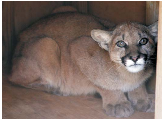
Above: Tejona: Left, above: Gobi, Left, below: Princess

Memberships will continue to include reciprocal benefits at many zoos across the United States. An updated reciprocal zoo list is enclosed with this newsletter.