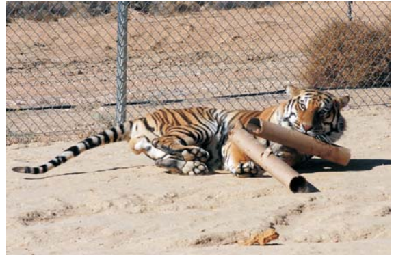
More Kid's Day photos (left) Tiger Bingo, Touch & Feel, making enrichments, train ride to the back area; (top) Pin the Tail, pony rides, Caesar enjoying his enrichments

or $30 per family? We also have engraved bricks on our Walk of Honor for $150. Cat adoptions start at $40 a month. You can purchase all kinds of items (clothing, ornaments, tote bags, pillows, calendars, posters) with our cats' pictures on them through our Cafepress site, . And of course don't forget our Amazon ( ) and igitve ( ) affiliate programs, each of which cost you nothing to use – just order online through our links and we receive a percentage of the purchase.