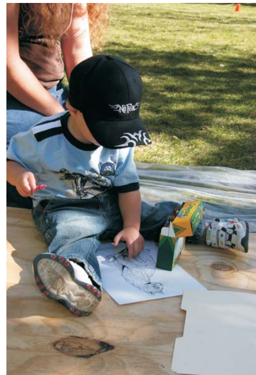
Kid's Day 2006- Animal Show (top 2), coloring table. More photos next page!