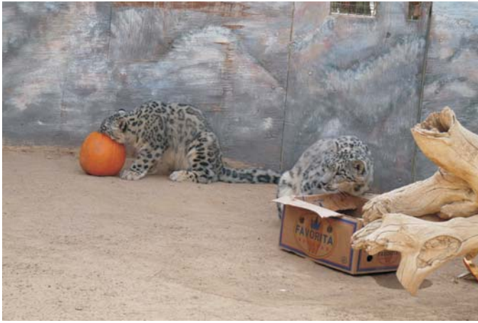
The snow leopards Anny and Zack enjoyed the enrichments the children designed and made on Kids' Day!

other volunteers to getting baby bobcat kisses. The EFBC is like a second home now, and all of our volunteers work hard to maintain the facility. It really is wonderful to be counted among them.