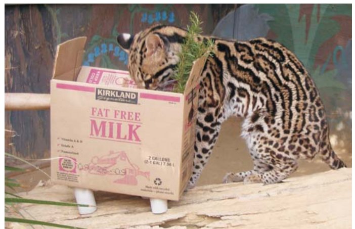
Rico, ocelot, enjoys his toy made by the enthusiastic children on Kids' day.