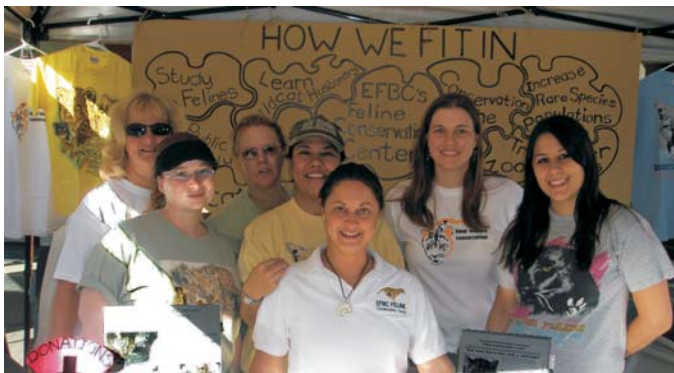
EFBC has a traveling booth that goes to many events. Here is the crew at the Wildlife Conservation Network event.

WCN conference a success! On October 3rd several of our volunteers and zookeepers had the opportunity to attend a Wildlife Conservation Network conference in San Francisco. The expo allows conservation organizations from around the world to get together and to learn from each