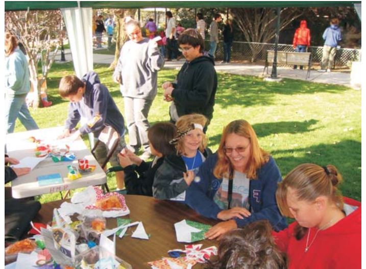
Origami was made easy with great teachers!