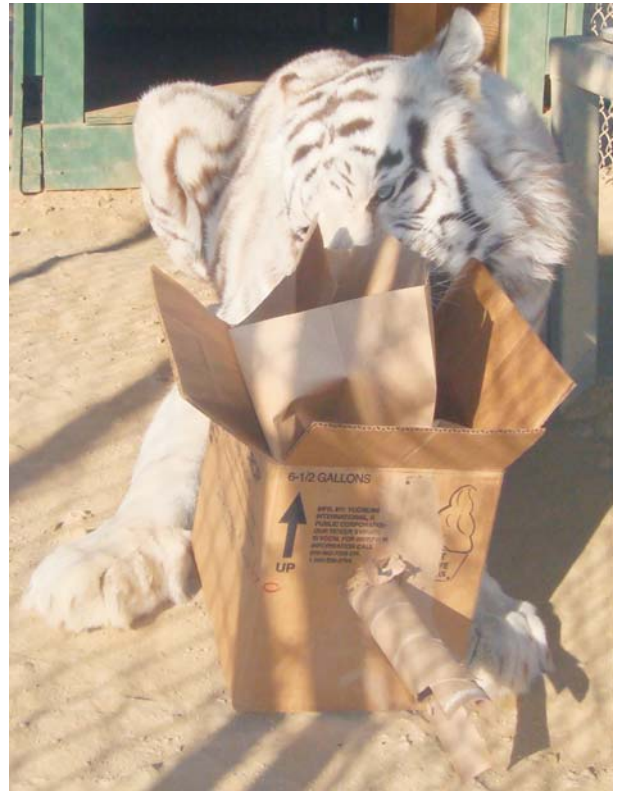
Katmandu, tiger, with toy on Kids' Day.